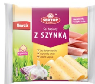
Z SZYNKĄ WITH HAM