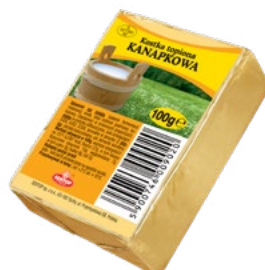
KANAPKOWA SANDWICH EAN: 5900746009020