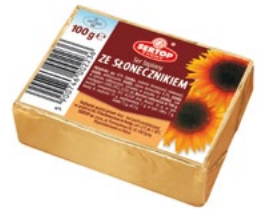
ZE SŁONECZNIKIEM WITH SUNFLOWER EAN: 5900746002236