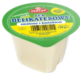
DELIKATESOWY Z KMINKIEM DELICACY WITH CARAWAY