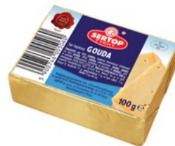
GOUDA WITH GOUDA CHEESE EAN: 5900746005060