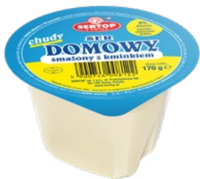
DOMOWY Z KMINKIEM HOME MADE WITH CARAWAY