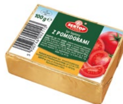
Z POMIDORAMI WITH TOMATOES EAN: 5900746002113