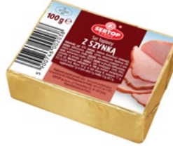
Z SZYŃKĄ WITH HAM EAN: 5900746002038