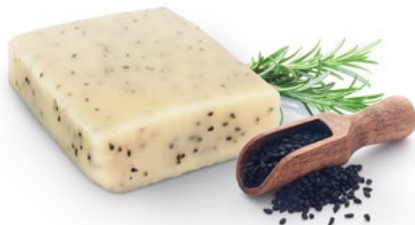
SMAŻONY Z CZARNUSZKĄ FRIED CHEESE WITH BLACK CUMIN