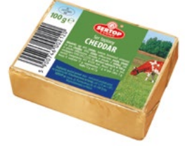
CHEDDAR WITH CHEDDAR CHEESE EAN: 5900746002120