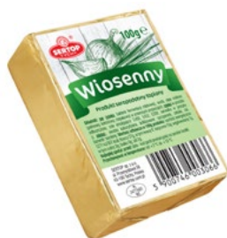
WIOSENNY SPRING EAN: 5900746003066