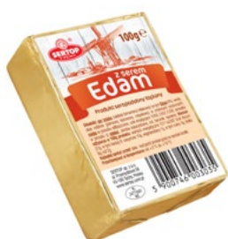
Z SEREM EDAM WITH EDAM CHEESE EAN: 5900746003035