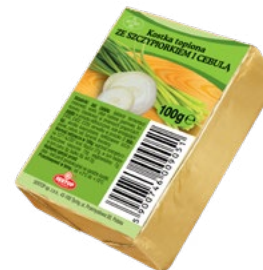
ZE SZCZYPIORKIEM I CEBULĄ WITH SPRING ONION AND ONION EAN: 5900746009051