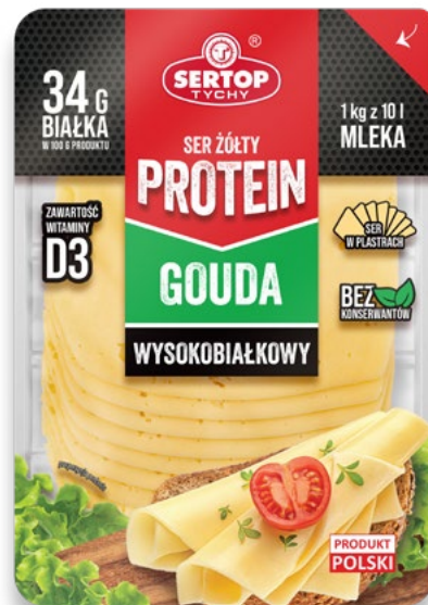
GOUDA | SER ŻÓŁTY W PŁASTRACH GOUDA | YELLOW CHEESE IN SLICES