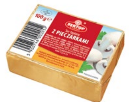
Z PIECZARKAMI WITH CHAMPIGNONS EAN: 5900 746002052