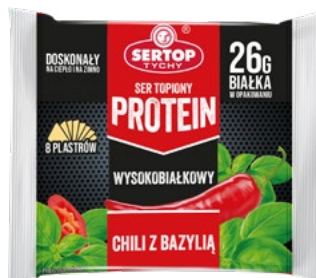
Z CHILI I BAZYLIĄ WITH CHILI WITH BASIL