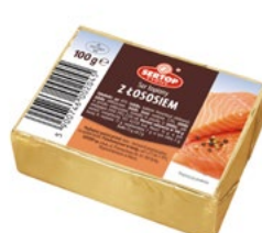
Z ŁOSOSIEM WITH SALMON EAN: 5900746002045