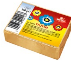
TYLŻYCKI TILSITER EAN: 5900746002168