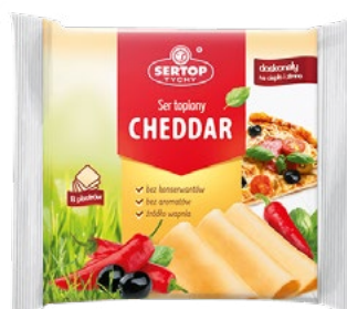
CHEDDAR WITH CHEDDAR CHEESE