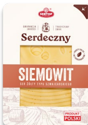
SER ŻÓŁTY SIEMOWIT YELLOW CHEESE SIEMOWIT