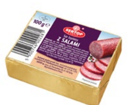
Z SALAMI WITH SALAMI EAN: 5900746002281