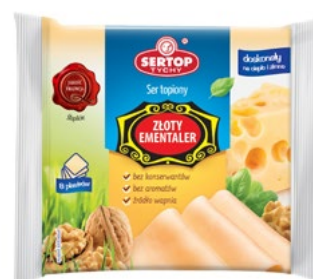
ZŁOTY EMENTALER GOLDEN EMMENTAL