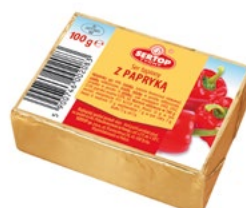
Z PAPRYKĄ WITH PAPRIKA EAN: 5900 746002083