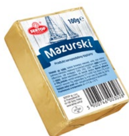
MAZURSKI MAZURSKI EAN: 5900746003028