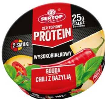
GOUDA | CHILI Z BAZYLIĄ GOUDA | CHILI WITH BASIL