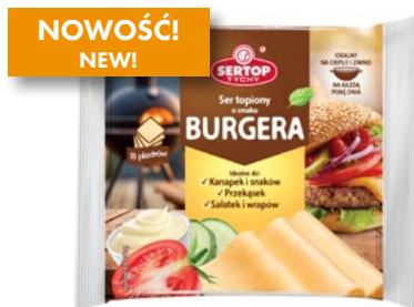
DO BURGERA FOR BURGER