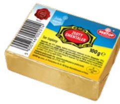
ZŁOTY EMENTALER GOLDEN EMENTALER EAN: 590074600214