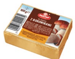
Z BOROWIKAMI WITH BOLETUS EAN: 5900746002274