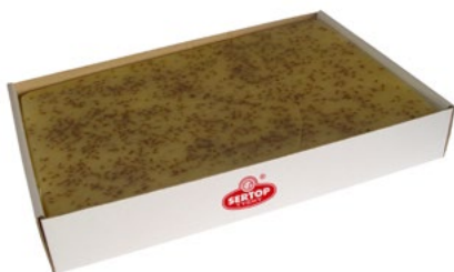
DOMOWY Z KMINKIEM HOME MADE WITH CARAWAY