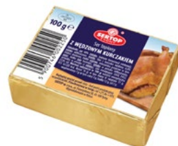
Z WĘDZONYM KURCZAKIEM WITH SMOKED CHICKEN EAN: 5900 746002250