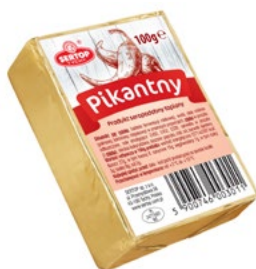
PIKANTNY SPICY EAN: 5900746003011