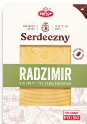
SER ŻÓŁTY RADZIMIR YELLOW CHEESE RADZIMIR