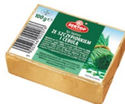
ZE SZCZUPIORKIEM I CEBULĄ WITH SPRING ONION AND ONION EAN: 5900 746002076