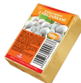
Z PIECZARKAMI WITH CHAMPIGNONS EAN: 5900746009037