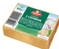
Z CZOSNKIEM WITH GARLIC EAN: 5900746002090