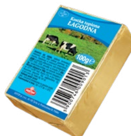
ŁAGODNA MILD EAN: 5900746009013