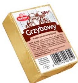
GRZYBOWY MUSHROOM EAN: 5900746003059