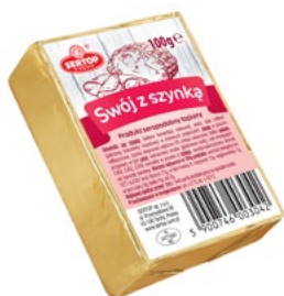
SWÓJ Z SZYNKĄ YOUR WITH HAM EAN: 5900746003042