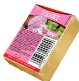
Z SZYNKĄ WITH HAM EAN: 5900746009044