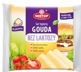
GOUDA BEZ LAKTOZY GOUDA LACTOSE FREE