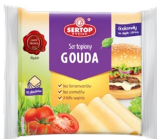
GOUDA WITH GOUDA CHEESE