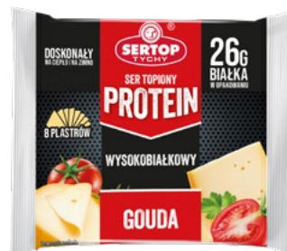
GOUDA WITH GOUDA CHEESE